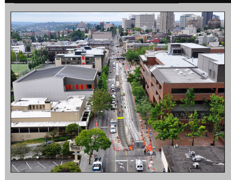
Trackway construction between Howell and Pine 8/8/2012