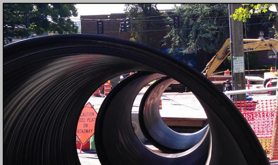
72" Storm Drain Pipe Ready for installation at Broadway and Yesler