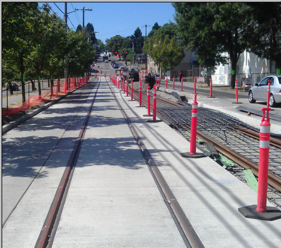
Completed "inbound" trackway on Yesler looking west from 14 th