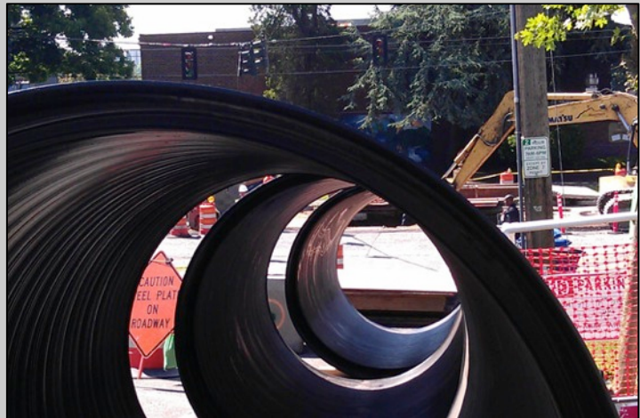
72" Storm Drain Pipe

Ready for installation at Broadway and Yesler