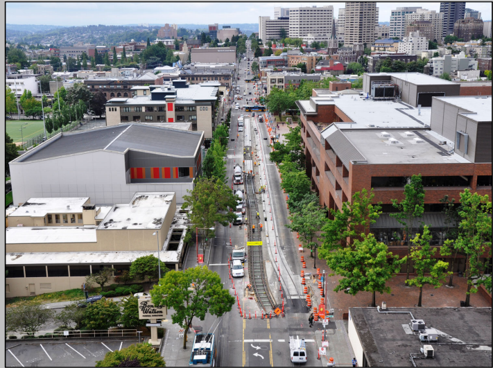
Trackway construction between Howell and Pine

8/8/2012