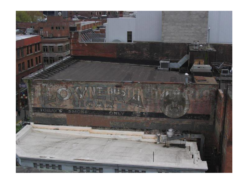
UW Special Collections