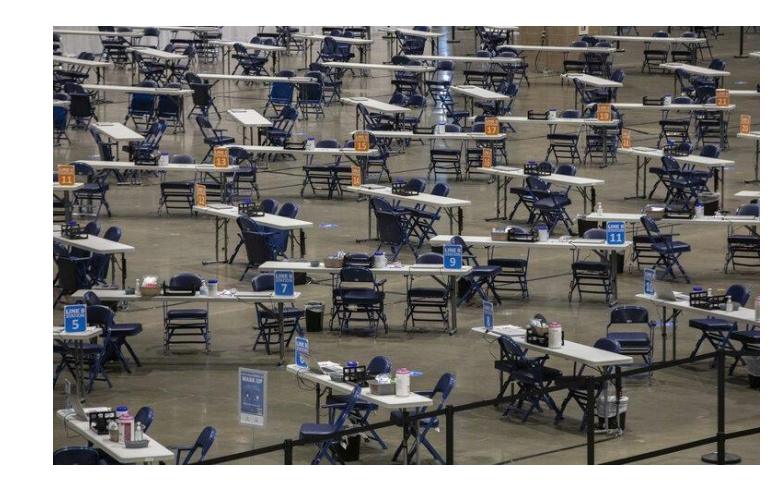
Lumen Field Event Center